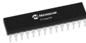
Fig 7: ATMEGA 328

It is a high Performance, low power AVR8-Bit Microcontroller with Advanced RISC Architecture. It has 131 Powerful Instructions with 32 x 8 General Purpose Working Registers. It can process up to 20 MIPS Throughput at 20 MHz with on chip 2-cycle Multiplier. It comes with High Endurance Non-volatile Memory Segments with 4/8/16/32K Bytes of In-System Self-Programmable Flash program memory 256/512/512/1K Bytes EEPROM and 512/1K/1K/2K Bytes Internal SRAM.