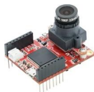
Fig 3: Camera

A camera with a minimum of 1Mpix resolution is used so that image processing is not affected. To paint at night, night vision cameras are used.