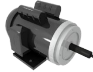
Fig 6: AC Motor