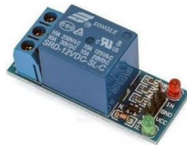
Fig 4: Relay

1-Channel 12V Relay Module is a 12V 1-channel relay interface board with screw terminal, it can be controlled directly by a wide range of microcontrollers such as Arduino, AVR, PIC, ARM and so on. The board has a high quality relay, which can handle a maximum of 15A @ 125V or 10AA @ 250V AC.