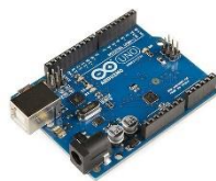
Fig 2: Arduino UNO

The Arduino UNO is a standard board of Arduino. Here UNO means 'one' in Italian. It was named as UNO to label the first release of Arduino Software. It was also the first USB board released by Arduino. It is considered as the powerful board used in various projects. Arduino.cc developed the Arduino UNO board.