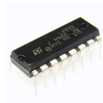
Fig 5: Motor Driver

The L293D is a 16-pin Motor Driver IC which can control a set of two DC motors simultaneously in any direction. The L293D is designed to provide bidirectional drive currents of up to 600 mA (per channel) at voltages from 4.5 V to 36 V (at pin 8!). You can use it to control small dc motors - toy motors.