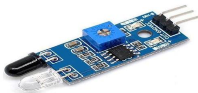
Fig 4.1: IR SENSOR

An infrared sensor is basically an electronic device which is used to detect the presence of objects. Infrared light is emitted by this device. If this device don’t detect any IR light reflected back that means there is no object present. If the light is detected by the sensor there is an object present. Arduino UNO is based on an ATmega328P microcontroller. It is easy to use compared to other board Arduino.